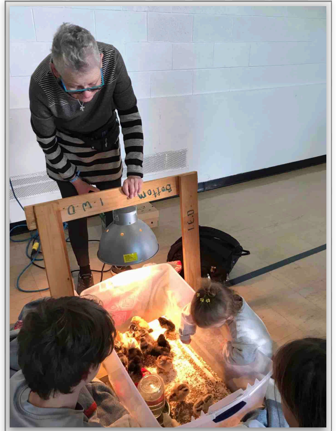
Spring Chicks Adored by children